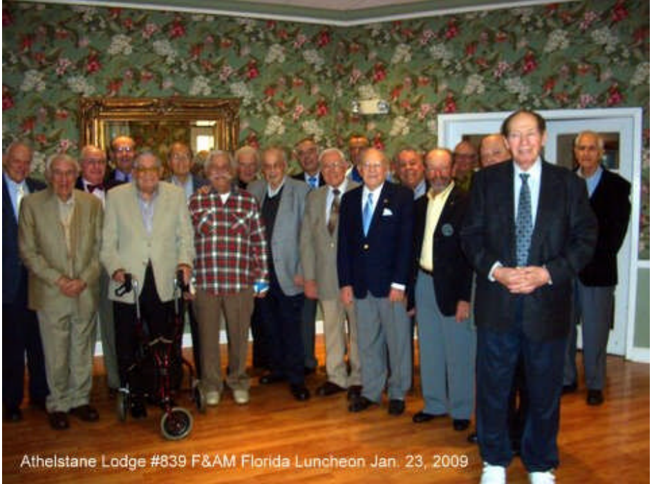
Athelstane Lodge #839 F&AM Florida Luncheon Jan. 23, 2009