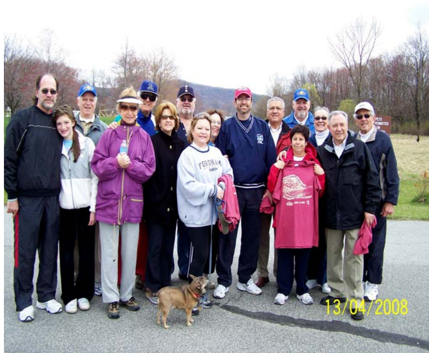
April 13th, 14 Athelstane Brothers and Ladies took part in the United Hospice Walk/Run at Rockland Lake in Congers, NY. This annual benefit event brings out many runners, walkers and strollers for a great cause.